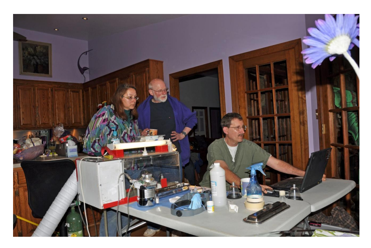
Imputing data on my ThinkPad computer for a client

This web site will also have information about my practice and articles pertaining to aviculture, health issues, and pet care. Client handout materials regarding various diseases and drug therapy protocols are also available upon request.